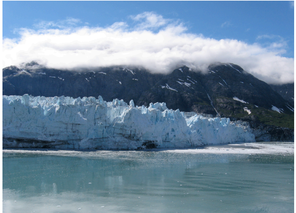
As ice sheets continue to change, scientists can expand LIVVkit to better inform the ice-sheet developments.

The impact is uncertainty in our understanding of the future of these immense ice sheets, their interactions with the other earth systems, and ultimately, their continued contribution to sea-level rise.